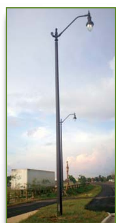
These graceful street lights along the busway are unique to Homestead