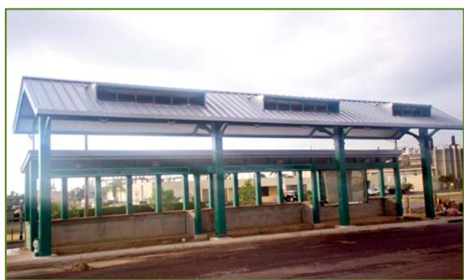
Historic themed bus shelter designed to depict Homestead's past

The City of Homestead is one of thirty-one cities receiving transportation surtax funds through the People's Transportation Plan (PTP) municipal program. It receives about $1.3 million dollars annually for transit and transportation projects. Homestead's hometown atmosphere welcomes visitors to the area and the community is proud of the continuing accomplishments that make the area an increasingly desirable place to live, work and raise a family. Despite being located amid bustling sprawl and development, Homestead has managed to maintain a unique "small-town" atmosphere with all the urban amenities.