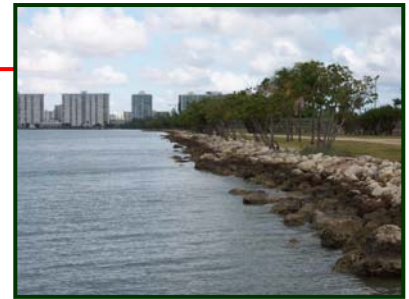
Hovercraft Proposed Landing Facility

A ramp could be constructed on the north side of the marina. This ramp not necessarily has to be in concrete. A portable ramp needs to be accessible for the boarding and alighting of passengers.