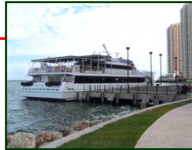
Existing Docking Facility

Hovercraft proposed location for the ramp and the area in the Bayfront Park that could be considered for a terminal facility.