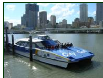
City Cat - Australia

This facility is recommended as a terminal facility. Parking and access to transit are available. This facility can accommodate both vessels type considered for the operation.