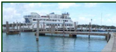
Catamaran Potential Docking Facility

Improvements are needed for the abandoned dock, including piling, construction of the deck and wider pier for passenger access.