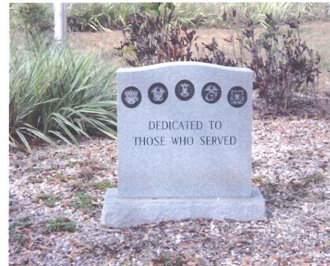
Miami-Dade County Cemetery 3/18/13