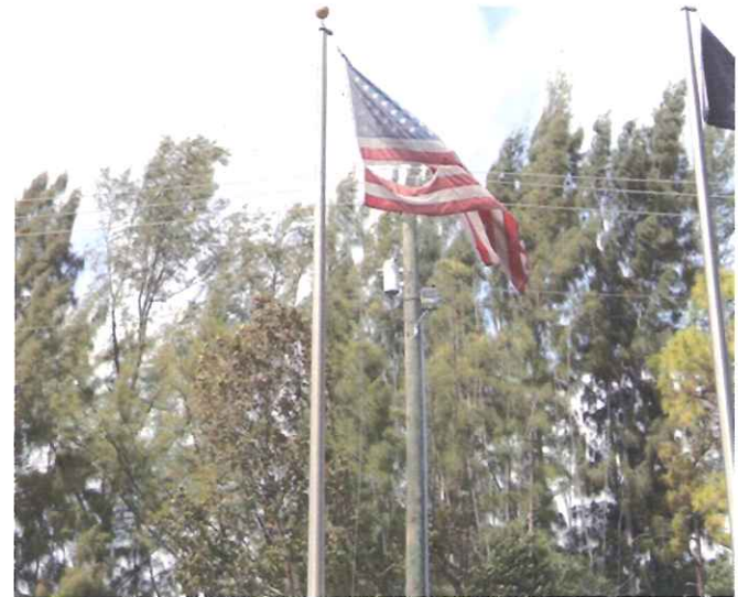
-Flag was replaced on 3/20/13