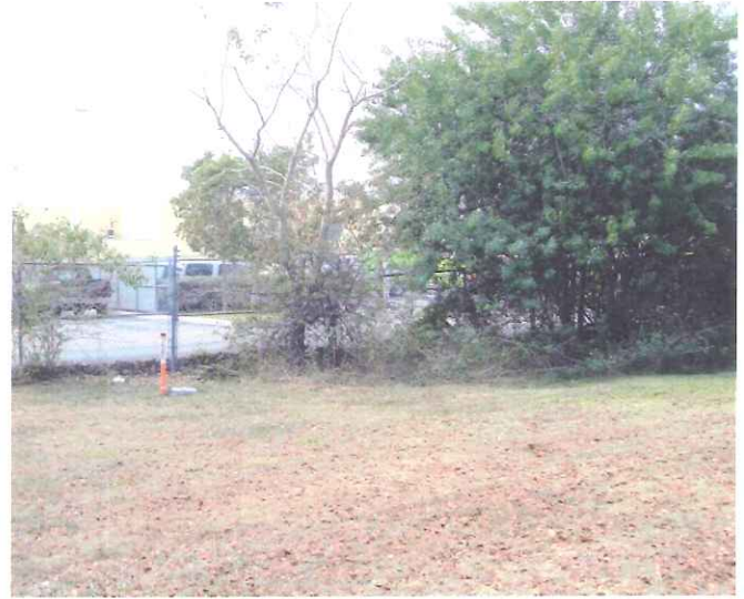
Miami- Dade County Cemetery 3/18/13