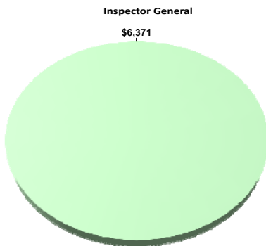
Expenditures by Activity (dollars in thousands)