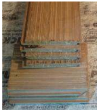
Figure 1: Staggering Method