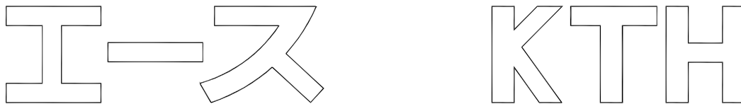
LABEL FOR ORIENTAL STYLE TILE (LOCATED ON UNDERSIDE OF TILE)

All tiles shall bear the imprint or identifiable marking of the manufacturer's name or logo (See Detail Below ), or following statement: "Miami-Dade County Product Control Approved".