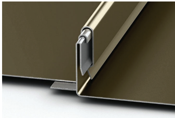
1.75" HIGH X 18" WIDE Q-175 PANEL

OPTIONAL FACTORY OR FIELD APPLIED SEALANT IN THE SEAM