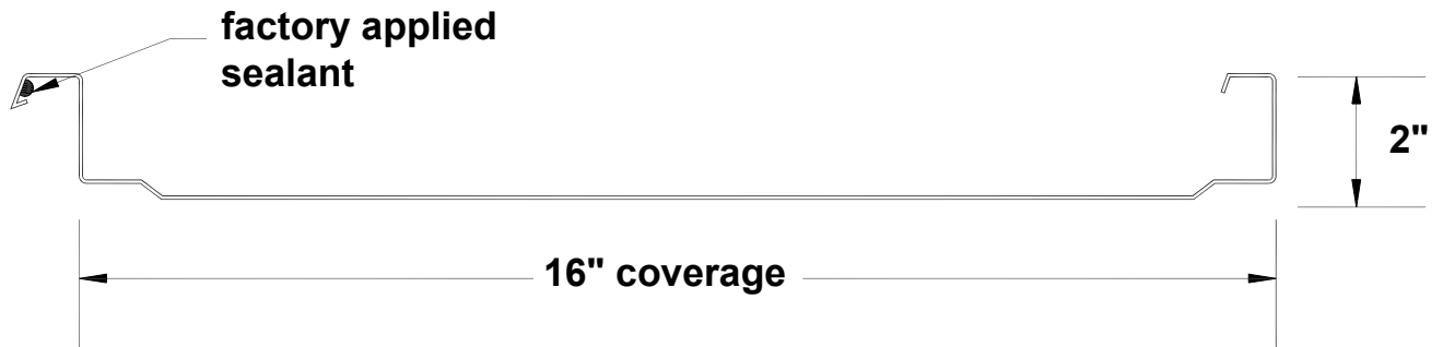
MAGNA-LOC 16" WIDE 24 GA. ROOF PANELS