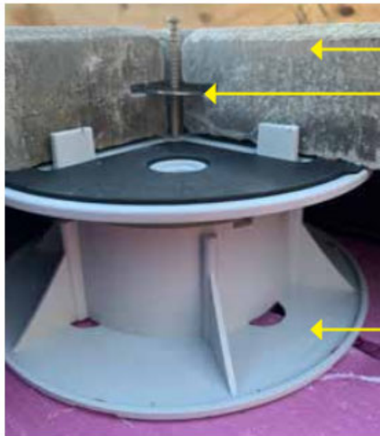
GRT CONCRETE WIND PAVERS WITH GRT PEDESTALS