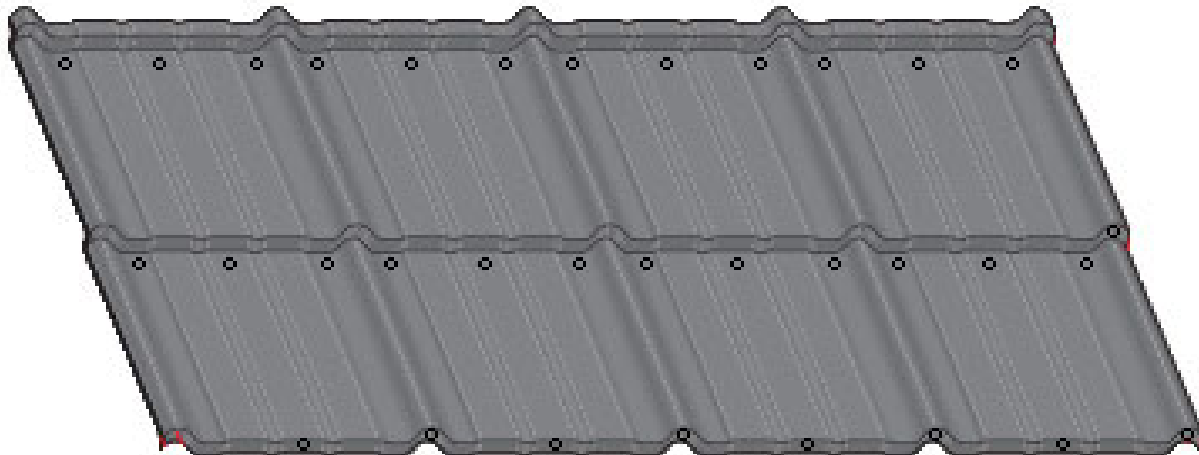
26GA. STEEL ESTIMA 24 FASTENERS/PANEL