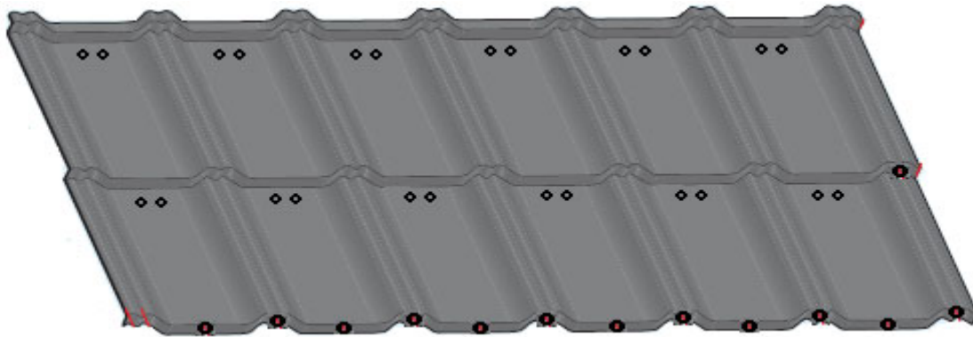
26GA. STEEL TREMBLANT/GERMAN SIMETRIC - 24 FASTENERS/PANEL