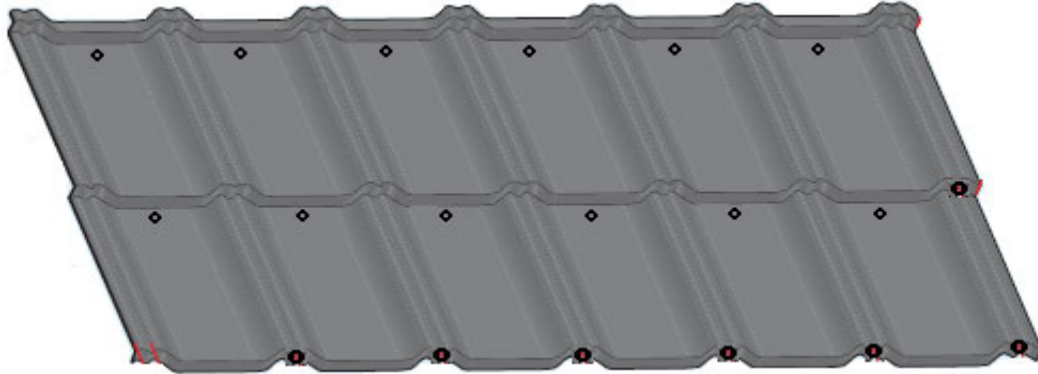
26GA. STEEL TREMBLANT/GERMAN SIMETRIC - 12 FASTENERS/PANEL