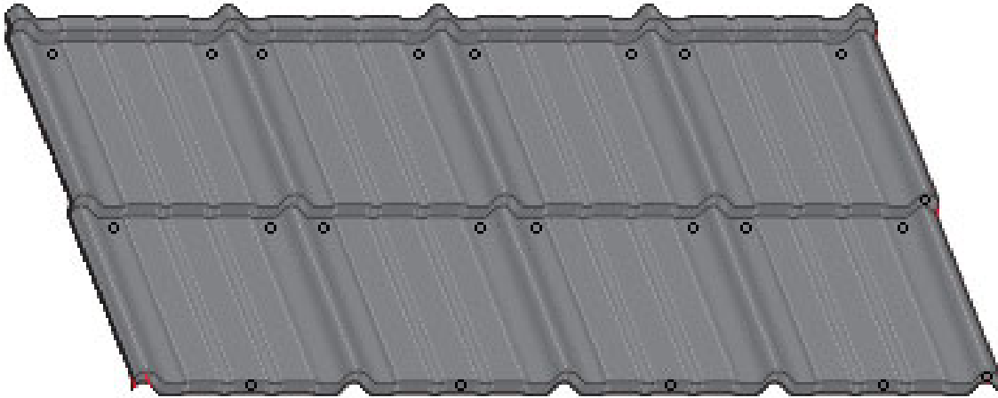
26GA. STEEL ESTIMA 16 FASTENERS/PANEL