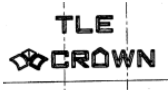
CROWN ROOF TILE (THIN LEADING EDGE) (LOCATED ON UNDERSIDE OF TILE)

All tiles shall bear the imprint or identifiable marking of the manufacturer's name or logo (See Detail Below), or following statement: "Miami-Dade County Product Control Approved".