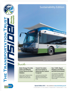
Transportation Trust Insider Newsletter

The programs and projects funded by the People's Transportation Plan (PTP) realized a number of major accomplishments during the quarter. These include: