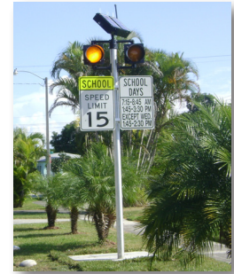
Solar powered school speed zone flashing signal