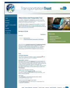
Revamped Transportation Trust Website