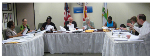
The CITT Nominating Committee in session

The full Transportation Trust met (3) three times during the 2nd Quarter and the subcommittees held four (4) meetings to consider and act on contracts and reports related to the PTP.