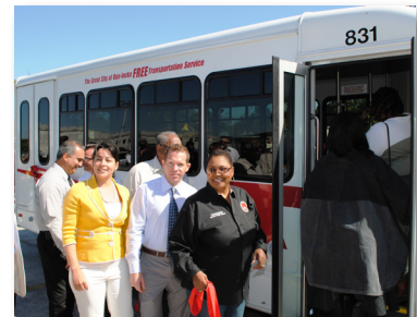
City officials and transportation partners board the Opa Locka Express on opening day

The City of Opa-Locka launched the PTP funded Opa-Locka Express bus service during the quarter. This shuttle service operates on two routes, five days a week, Monday – Friday, 6:00 a.m. – 7:00 p.m. Both routes link with the local Tri- Rail station and passengers can also connect with the County's Metrobus routes that operate in the area. The Opa Locka Express, through an agreement with the South Florida Regional Transportation Authority; the governing body for Tri-Rail, provides convenient public transit service in the downtown and industrial areas of the city.