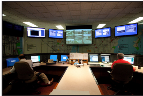
ATMS Control Room

The Miami-Dade Public Works and Waste Management Department (PWWM) is responsible for developing and implementing PTP funded roadway projects including paving, traffic signals, signage, bike paths, lighting, drainage, curb cuts and guard rails. PWWM reports the following activities related to PTP projects during this quarter: