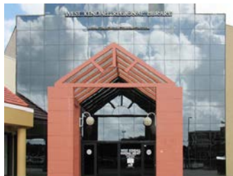
West Kendall Regional 10201 Hammocks Boulevard

See upcoming events at the Kendale Lakes Branch here!