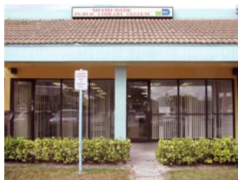
Tamiami 13250 SW 8 Street

See upcoming events at the West Kendall Regional branch here!