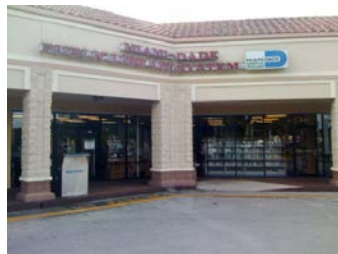
Lakes of the Meadow 4284 SW 152 Avenue

West Kendall Regional Library will also be open on Sundays from 10 a.m. - 6 p.m.