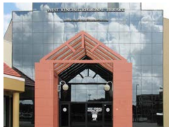
West Kendall Regional 10201 Hammocks Boulevard

See upcoming events at the Kendale Lakes Branch here!