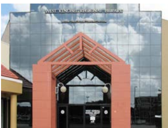
West Kendall Regional

See upcoming events at the Kendale Lakes Branch here!