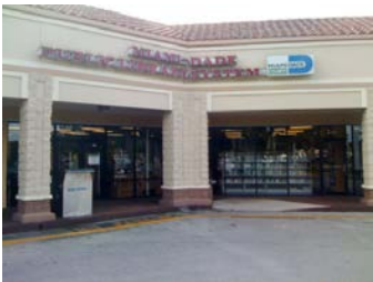
Lakes of the Meadow 4284 SW 152 Avenue

Your local library has a jam-packed summer of fun for you!