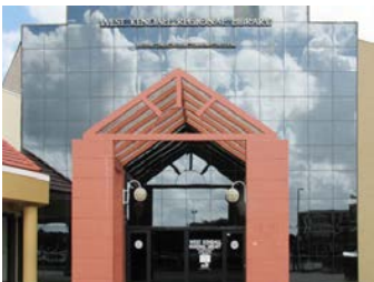
West Kendall Regional

See upcoming events at the Kendale Lakes Branch here!