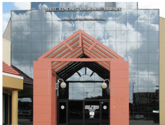
West Kendall Regional 10201 Hammocks Boulevard

See upcoming events at the Kendale Lakes Branch here!