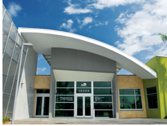
Kendale Lakes 15205 SW 88 Street

See upcoming events at the Lakes of the Meadow branch here!