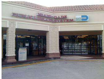
Lakes of the Meadow 4284 SW 152 Avenue

West Kendall Regional Library will also be open on Sundays from 10 a.m. - 6 p.m.