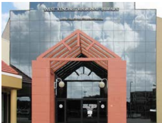
West Kendall Regional 10201 Hammocks Boulevard

See upcoming events at the Kendale Lakes Branch here!