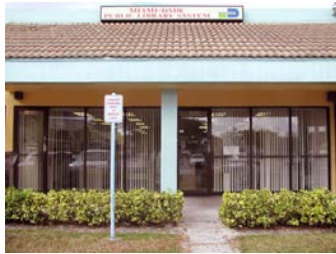
Tamiami 13250 SW 8 Street

See upcoming events at the Tamiami branch here!