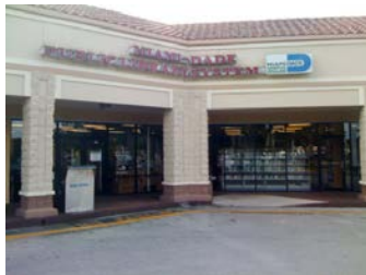
Lakes of the Meadow 4284 SW 152 Avenue

Please note that library hours have now changed to Monday, Wednesday, Friday 10 a.m. - 6 p.m. & Tuesday & Thursday Noon - 8 p.m. West Kendall Regional Library will also be open on Sundays from 10 a.m. - 6 p.m.