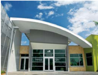
Kendale Lakes 15205 SW 88 Street

See upcoming events at the Lakes of the Meadow branch here!