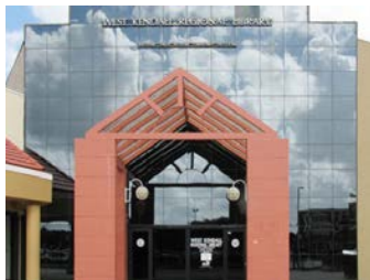
West Kendall Regional 10201 Hammocks Boulevard

See upcoming events at the Kendale Lakes Branch here!