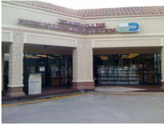
Lakes of the Meadow 4284 SW 152 Avenue

Your local library has amazing events waiting for you!