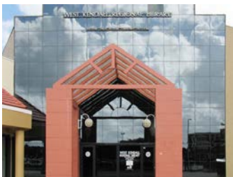
West Kendall Regional 10201 Hammocks Boulevard

See upcoming events at the Kendale Lakes Branch here!