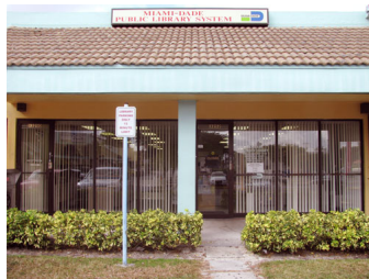
Tamiami 13250 SW 8 Street

See upcoming events at the West Kendall Regional branch here!