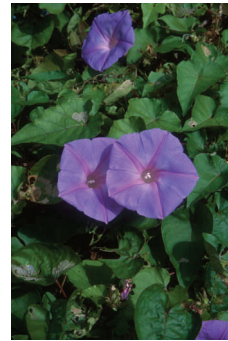
Ipomea indica

Morning-glories are like monarch butterflies in that their common name has widespread recognition. The true morning-glories in the genus Ipomea are well represented in Florida with 12 native species and 13 naturalized species. The most widely known morning-glory is undoubtedly Ipomea batatas , the cultivated sweet potato (and boniato). And there are several native species that are well known to Florida residents, and these are moonflower ( Ipomea alba ), a familiar sight along fencerows with large showy white flowers that open at night and close in early morning, ocean-blue morning-glory ( Ipomea indica var. acuminata ), another common species along fencerows and in various natural habitats, with pinkish violet flowers, and railroad vine ( Ipomea pes-caprea ), that should be familiar to anyone who has stepped foot on Florida's sandy beaches. It is a common dune plant with long stems running up and down the dunes, and produces pinkish purple flowers. In ancient Hawaii the trumpet-shaped flowers of railroad vine were used as a soothing sheath following circumcision.