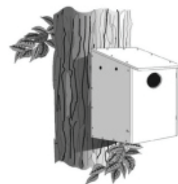
Illustration by Wade Henry

A: The box should be made out of rough-sawed wood with the rough side on the inside of the box. The bottom should be 8" x 8", the height 12-15" and the 3" hole should be placed 9-12" above the floor. The recommended height above the ground is 10-30 feet. These are easy birds to entice into a manmade nesting box if the proper home is offered to them. Remember to drill some small vent holes beneath the roof for air circulation and a few small holes in the floor for drainage.