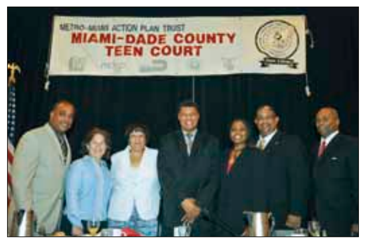
City and County officials with Teen Court staff.

the ongoing mission for M-DCTC, a peer sanctioning program to address face-to-face the rise of violence in Continued\ on\ page\ 2