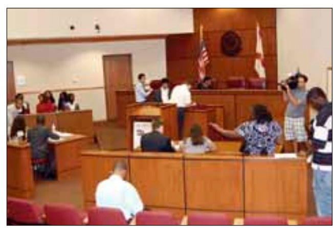
Mock Trial filmed by WPLG News

Teen Court collaborated with St. Thomas University's School of Law, Miami Carol City Senior High School's Law Magnet Program to conduct the mock trial. The story aired on June 16, 2009 during the 6:00 a.m. and noon news segments.