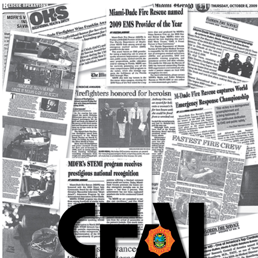
Always Ready. Proud to Serve Commission on Fire Accreditation International

At the conclusion of the onsite visit, the Peer Assessment Team will advise MDFR whether they will make a favorable recommendation to accredit the department. The Peer Assessment Team will complete the Peer Assessment Report, which outlines strengths, weakness and corrections/opportunities needed to achieve accreditation status. The Assessment Team, MDFR and County management would then appear before the Commission on Fire Accreditation International at the Fire Rescue International Conference in August 2010 for accreditation.