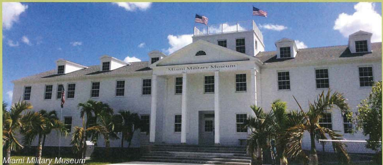
Miami Military Museum