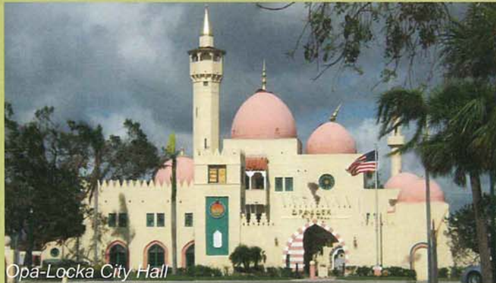
Opa-Locka City Hall