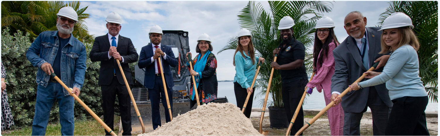
May 2026 Update