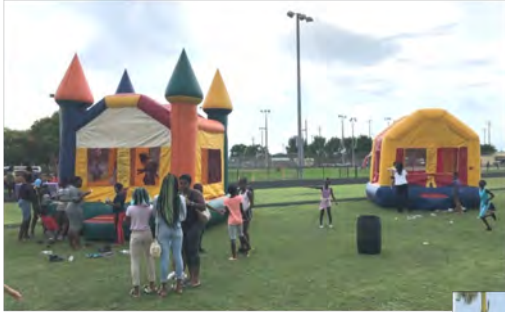
BOUNCE HOUSES & PICNIC AREAS