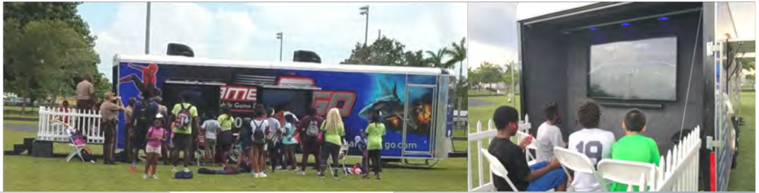
Children having fun and playing video games with the officers in the Gamers-To-Go Truck