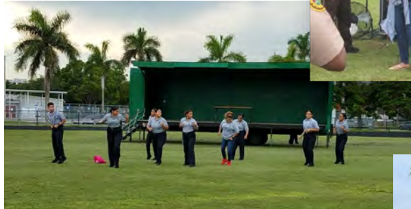
Kids playing ball with police