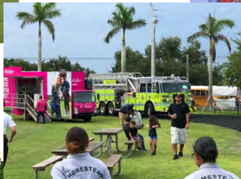
Our Project PEACE Booth