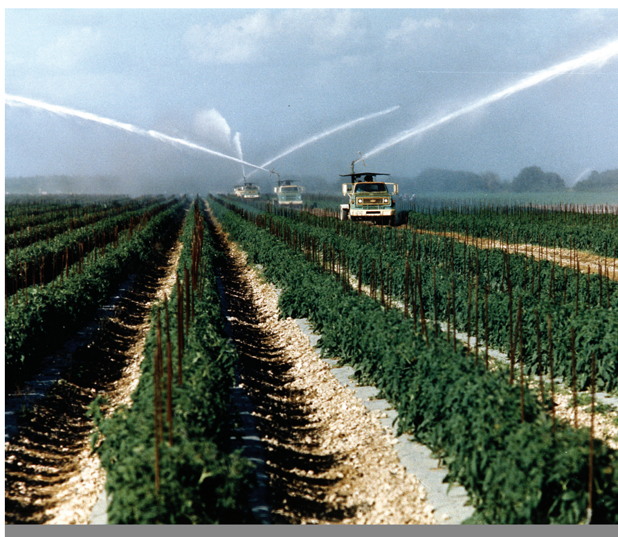
Agriculture provides an economic impact of more than $2.57 billion to the local and state economy (Dade County Farm Bureau).

Green economy concepts need to be integrated into current Miami-Dade economic development strategies. This is necessary to stay competitive as a business destination while helping existing local businesses incorporate the new demands of environmentally conscious consumers. Building a green economy in Miami-Dade is not just about attracting a few new industries that may need to find a local market. The focus needs to be on our existing businesses and industries, on examining new technologies and emerging clean industry and new technologies coupled with innovative public policy to align these components.