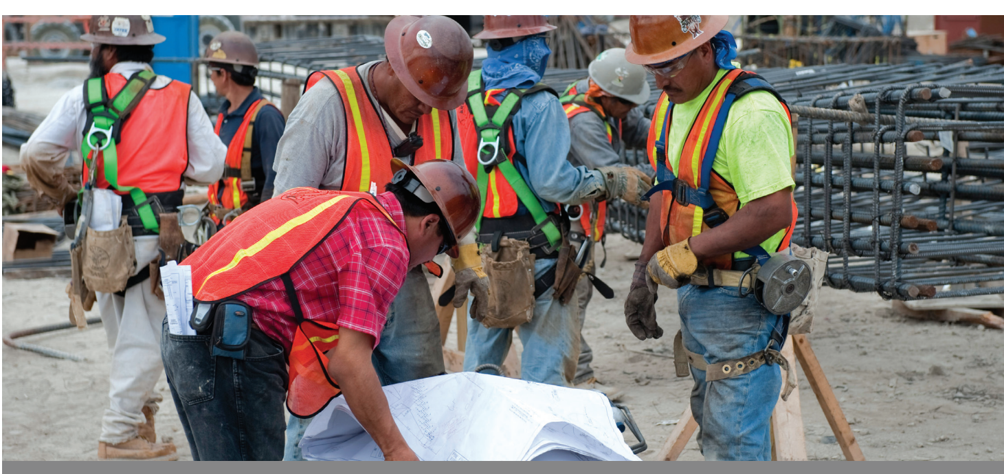
A new Florida Marlins Baseball Ballpark is under construction with a sustainability approach. The ballpark will be accessible via public transportation, will have solar panels on its parking garages, will have accessible seating, and will be applying for Leadership in Energy and Environmental Design (LEED) Silver certification. Five thousand constructions jobs are projected by the end of the project and once the Ballpark is open, 2,550 full and part-time jobs are anticipated.

The conversation is no longer about the emergence of new industry, but rather about transforming our notion of economic activity. The goals are towards developing an economy that takes into consideration the more efficient and sustainable use of limited resources.