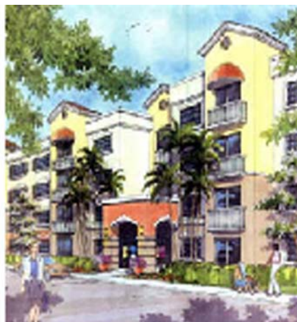
Artist rendering of Corinthian Apartments.

Former Scott-Carver residents will be informed once leasing information is available.