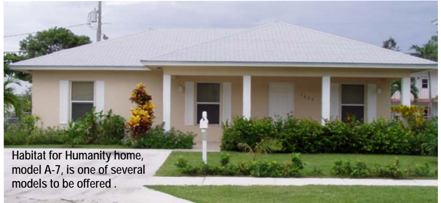
Habitat for Humanity home, model A-7, is one of several models to be offered.

Due to Habitat's proven success with the HOPE VI program — and their commitment to subcontract, as much as possible, with small and local businesses. This commitment to create jobs for local residents fosters Habitat's continued participation in the program.