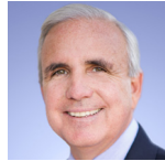
Carlos A. Gimenez Mayor