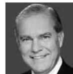
Sen. Javier D. Souto District 10