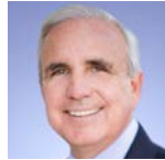
Carlos A. Gimenez Mayor