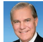
Sen. Javier D. Souto District 10