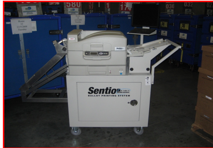
Ballot on Demand Technology to Print Voter's Individual Ballot