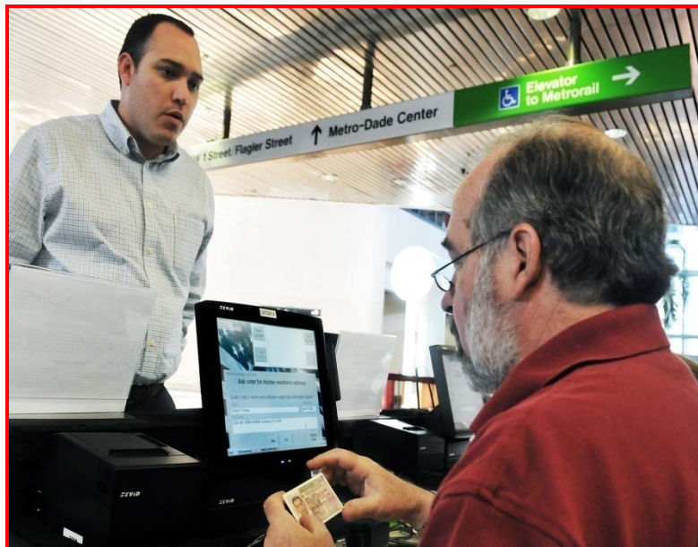
EVID Technology to Check Voters In