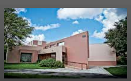
MIAMI-DADE PUBLIC SAFETY TRAINING INSTITUTE