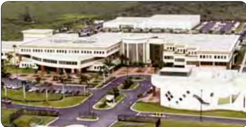
Miami-Dade Police Department Fred Taylor Headquarters Complex