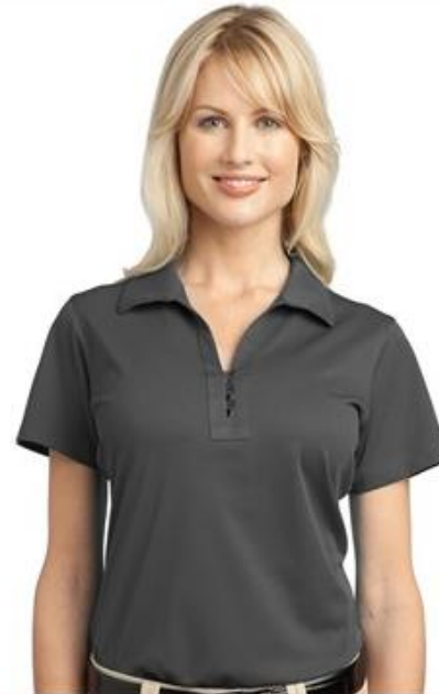
Port Authority Ladies Tech Pique Polo

Full Description: Our newest polo is a working person's dream: versatile, moisture-wicking and available in a rainbow of vibrant colors to complement any logo. This polo truly delivers with UV protection and exceptional performance at a real value.