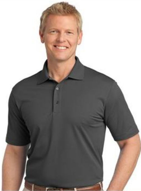
Port Authority Tech Pique Polo