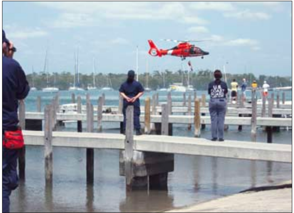
Helicopter rescue at Crandon Marina

On May 14, 2008, Crandon Park Marina hosted representatives from the Miami-Dade County Marine Patrol Unit, the U.S. Coast Guard, the U.S. Coast Guard Auxiliary, and numerous units from other municipalities to kick off Boating Safety Awareness Week. Speakers from these agencies stressed the importance of year-round water safety and made everyone aware of the resources available to promote and enforce water safety. The U.S. Coast Guard demonstrated an emergency recovery on the water from their evacuation helicopter, showing the professionalism and exemplary work they perform day in and day out.