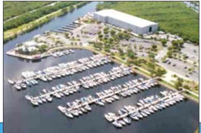
The Black Point Marina Basin