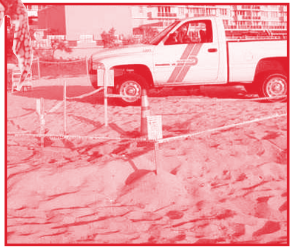
"In Situ" Leatherback Sea Turtle nest is left in its natural location and marked to protect the nest and eggs.