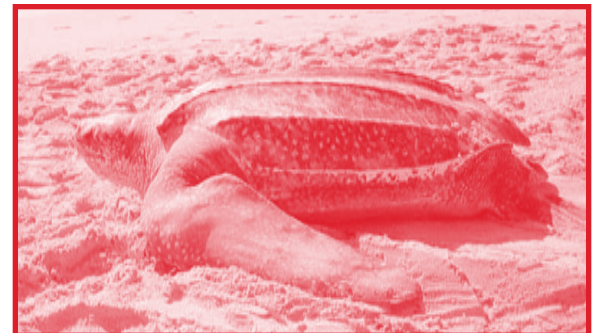
Female Leatherback Sea Turtle makes her way back to the water after digging her nest and laying eggs on the beach at Surfside and 94th Street on April 15, 2006 at 8:00 AM.

Five species of sea turtles inhabit the coastal waters of Florida. These are the highly endangered Kemp's Ridley, Hawksbill, Leatherback, Green, and the more common Loggerhead sea turtle. Hawksbill and Leatherback turtles