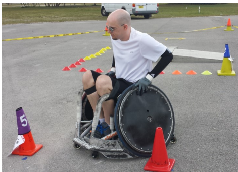
Every participant had the opportunity to challenge themselves on the wheelchair obstacle course.