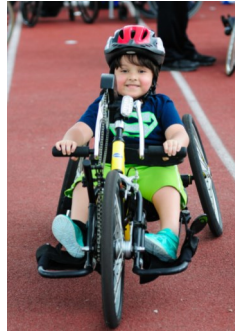
Photos from the 9th Annual Paralympic Experience held on March 22nd, 2014 at Tropical Park.