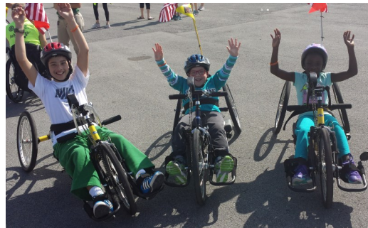
Children from the Super Sports Saturday program participate in the Hope & Possibility Event.