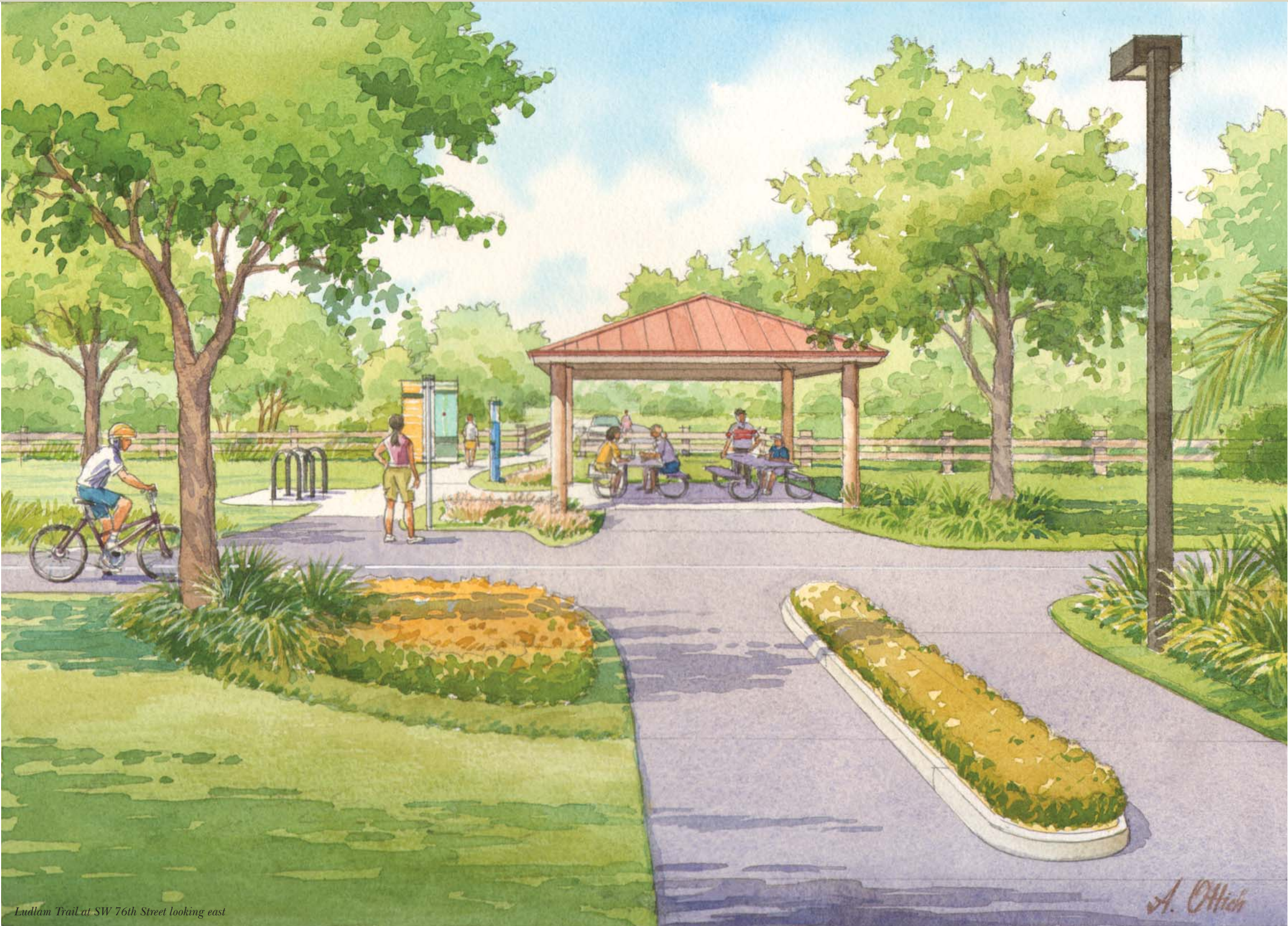
Ludlam Trail at SW 76th Street looking east

The SW 76th Street neighborhood connection ‘after’ image to the left shows the layout of a ‘rest area’ with covered seating, trash receptacle, multiple access points and emergency phone. Low level pedestrian lighting is shown and is recommended only at decision making areas such as roadway crossings, trailheads or rest areas.