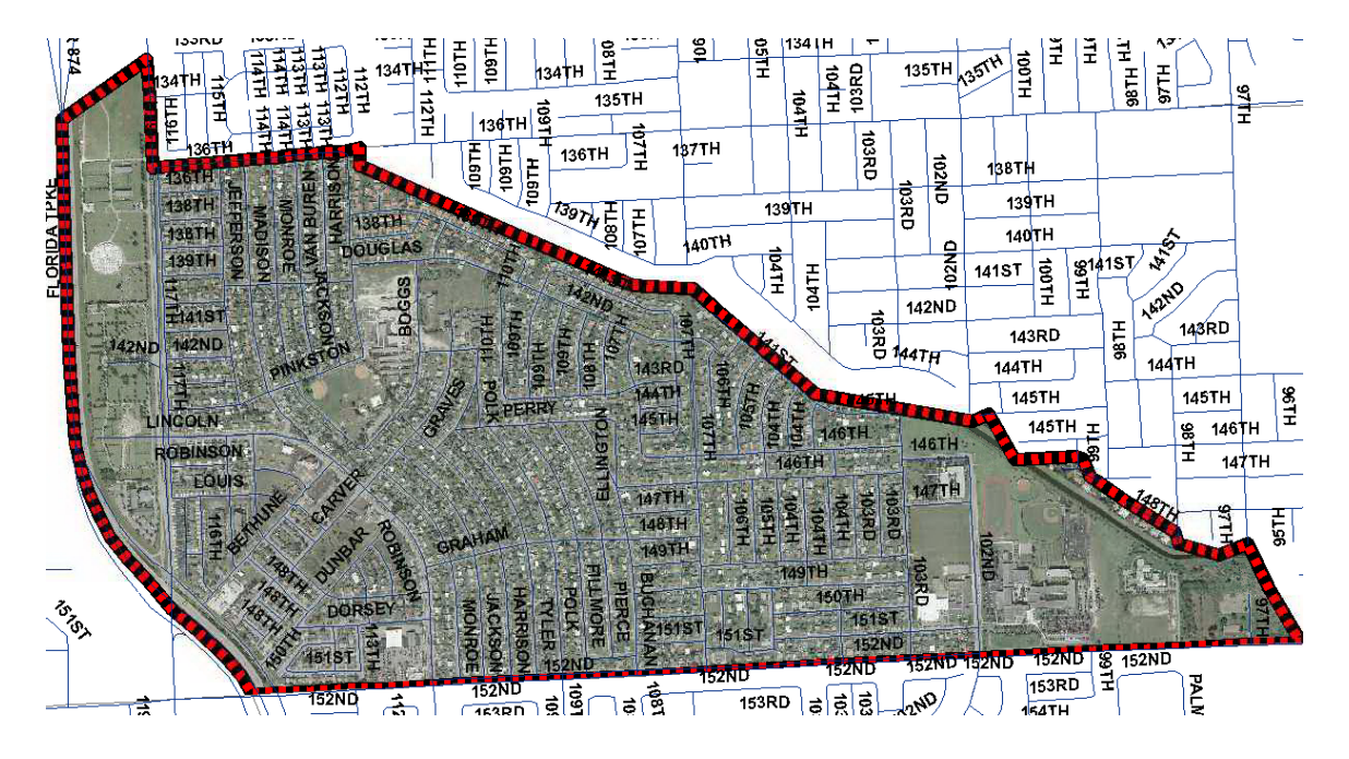
Figure 1 Richmond Heights Study Area

The Richmond Heights study area is located in Miami-Dade County, approximately 15 miles southwest of Downtown Miami. The area is somewhat triangular and is bounded by Coral Reef Drive on the south, SW 117<sup>th</sup> Avenue on the west, and the SW 136<sup>th</sup> Street and the C-100 Canal on the north and east.