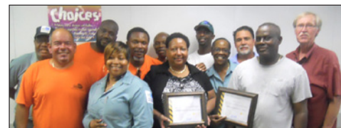
Resources Recovery employees pose proudly with their well-deserved certificates.

Even though the risk of injury while walking is low, you should always check with your doctor before beginning any new program of exercise, and make sure you wear comfortable shoes when you walk.