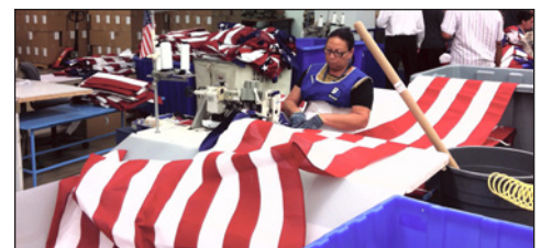
A Goodwill employee sews an American flag at Goodwill's manufacturing facility.