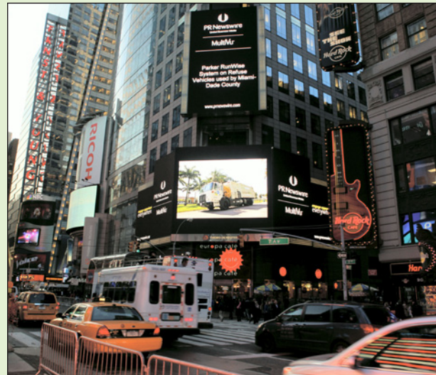
One of the Department's hybrid waste collection vehicles makes PR Newswire's electronic bulletin board on Times Square in New York City.

Beginning this month, the Department's use of hybrid technology will extend to heavy equipment. As of press time, the Department was set to accept delivery on a new Caterpillar D7E, a diesel-electric hybrid bulldozer. The bulldozer is slated for use on the working face at the South Dade Landfill. According to the manufacturer's website, this hybrid bulldozer is 25 percent more efficient than a similar, conventional-power bulldozer.