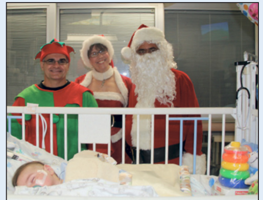
Santa and his helpers (Technical Services Division staff) hand out toys to hospitalized children.

After playing falafel chefs and servers, Technical Services staff took on the role of Santa's helpers, purchasing toys and helping make this holiday season a little brighter for some girls and boys who aren't feeling so well. The toys were distributed to children at the Holtz Children's Hospital (at the University of Miami/Jackson Memorial Medical Center) and The Kidz Korner, a pediatric rehabilitation and ventilator management center.