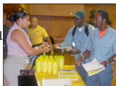
The Safety and Health Awareness Fair at 3B.

Congratulations and thanks to everybody for participating!