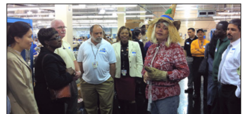
A Goodwill employee, dressed to celebrate Halloween, conducts a tour of Goodwill's manufacturing facility for senior PWWM staff.

benefit those in our community who need a helping hand. Please consider increasing your contribution or making a first-time gift to United Way.