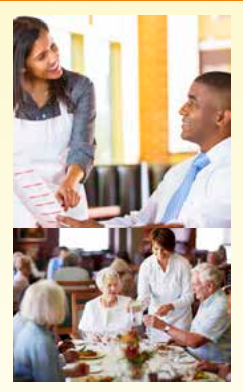
Foods consumed away from home have more calories

In November 2014 the U.S. Food and Drug Administration (FDA) finalized two rules requiring calorie information to be listed on menus and menu boards in chain restaurants, similar retail food establishments, and vending machines to help consumers make informed decisions about meals and snacks. The rules are included in a section of the Affordable Care Act. The menu labeling rule also includes food facilities in entertainment venue chains such as movie