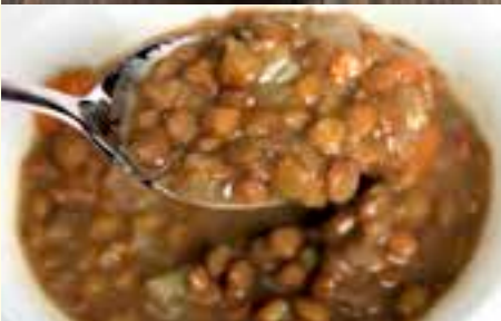
This diet may guard against aging at the very basic cellular level

those who don't follow the diet. The researchers looked at one indicator of aging called telomeres. Telomeres are sequences of DNA located at the end of chromosomes, like the plastic tip on the end of shoelaces that naturally shorten with age. Telomeres get shorter every time a cell divides, so their length is thought to be a measure of a cell's aging. What this study indicates is that the genetic material in our body that predicts life expectancy has an association with the Mediterranean diet.