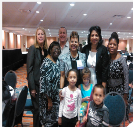
Community Action and Human Services 2014-2015 Leadership Training