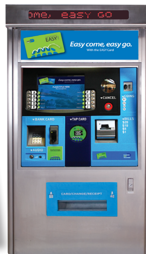
Ticket Vending Machine (TVM)