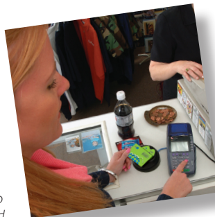
Adding money to the EASY Card