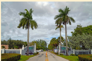
Miami-Dade Public Safety Training Institute & Research Center