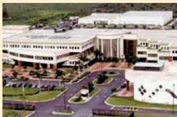
MDPD Fred Taylor Headquarters Building