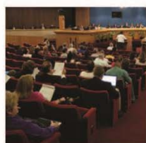
September 8 First public budget hearing