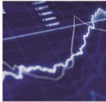
December - January Budget forecasting for coming year

In accordance with Section 1800A of the Code, public meetings are required to be held throughout the County in August to discuss proposed new or increased rates for fees and taxes. Two public budget hearings are held in September prior to the adoption of the budget, set by a very specific calendar outlines in state law. At the conclusion of the second public hearing, the BCC makes final budget decisions, establishes tax rates, and adopts the budget ordinances for the fiscal year which begins on October 1. During the course of the fiscal year these budgets may be amended through supplemental budget appropriations approved by the BCC, which usually take place during mid-year and at year-end.