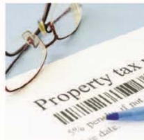
August Notices of Property Taxes mailed; Commission workshops held