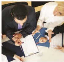
January - April Departmental budget preparation and meetings