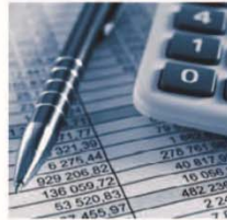
July 19 Maximum tax rates adopted by County Commission