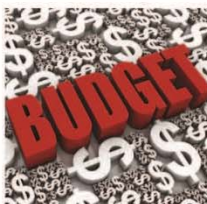
July 7 Proposed Budget presented