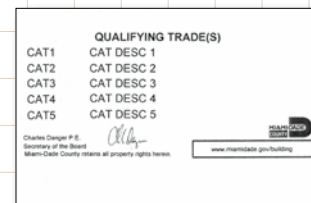
Front and back view of Building and Neighborhood Compliance Department license identification card. The card displays the trades which the license holder has been approved to perform.