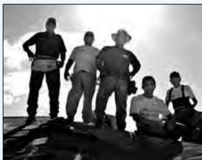
Pictured on the rooftop are several Building Department inspectors and plans processors volunteering of their expertise at the Habitat for Humanity Building Blitz.