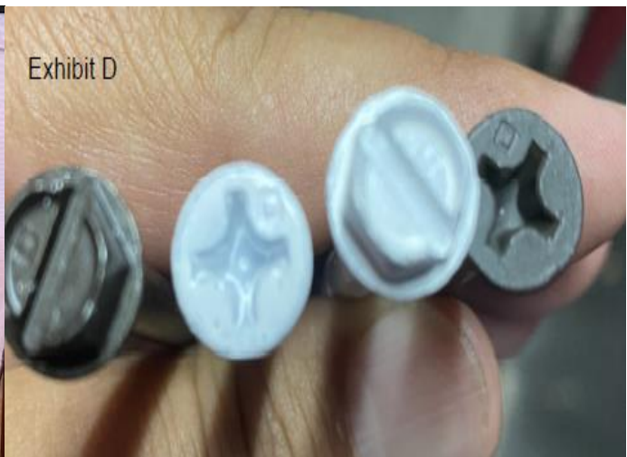
Non-conforming, non-approved head markings with square or diamond.