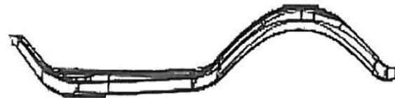
TERRACOTAGRES "S" CLAY ROOF TILE